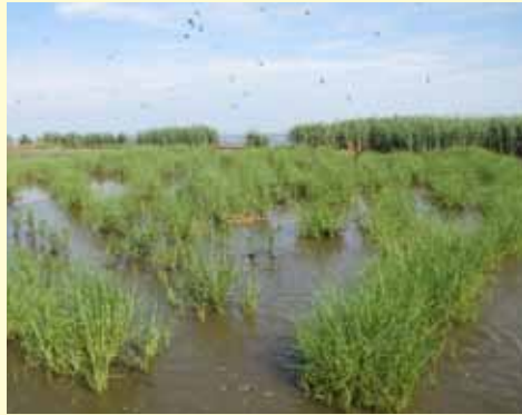
Gulf Saver bags at 4 months