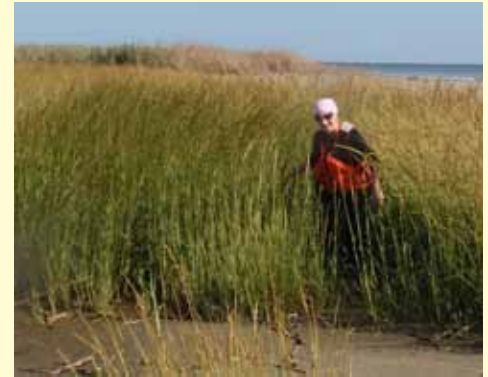
Gulf Saver bags at 8 months