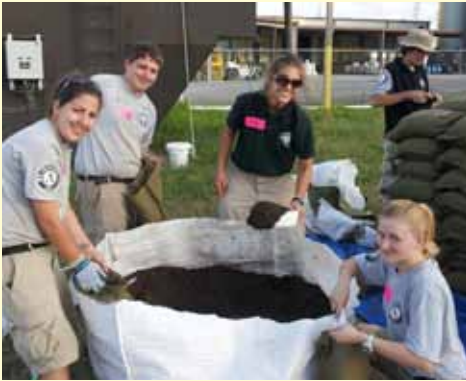
Bag Filling with custom mix